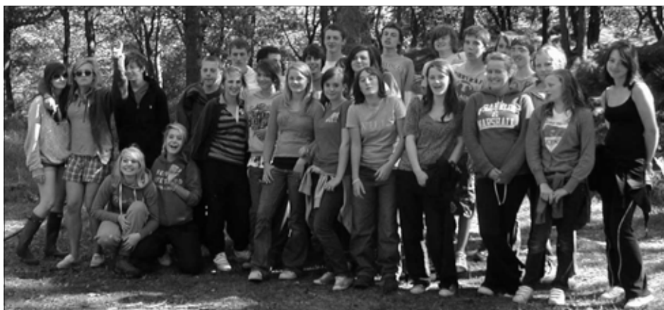
Finally after 7 camps a dry one! 30 Explorers and 9 Leaders enjoyed their annual camp in the Lake District with activities from Kayaking to rifle shooting