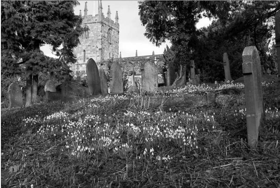
The snowdrops at St. Boniface

We announced last month that the current editorial team for the Link will be relinquishing the job after the April issue. Luckily a new team of six have stepped forward and you can look forward to some exciting changes in the May issue. It is good to know the magazine will continue.