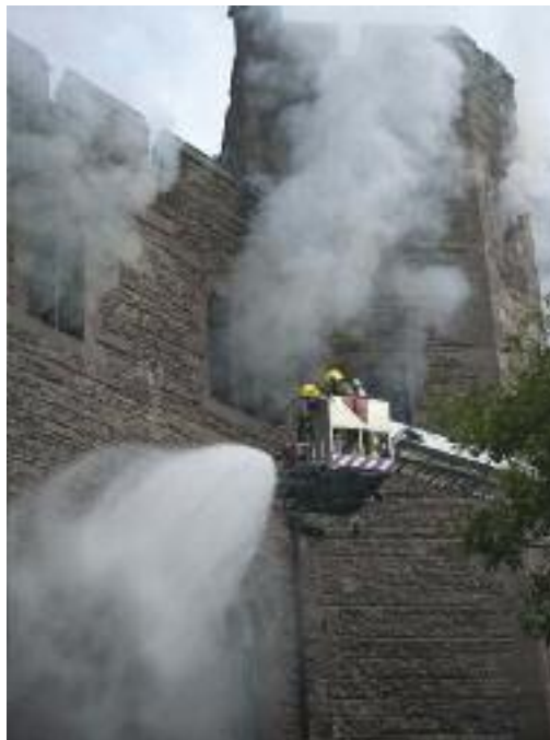
MAJOR JOB: At one point 100 firemen were tackling the blaze that destroyed the drawing room and 10 bedrooms at Peckforton Castle

VICAR Rick Gates rolled up at Peckforton Castle last month to bless a happy couple – unaware that the castle had been partially destroyed in a suspected arson attack.