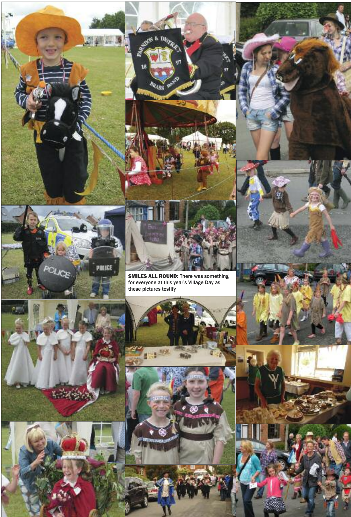
SMILES ALL ROUND: There was something for everyone at this year's Village Day as these pictures testify