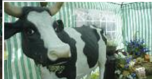
BLOOMING LOVELY: Calveley Parish Church was awash with colour thanks to the flower festival which drew large crowds to the beautiful church