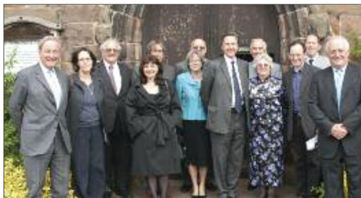
IMPORTANT GATHERING: The Haberdashers outside St Boniface Church

From time to time the Haberdashers support church projects – examples include the youth worker and the Ridgway Window – and village projects, most recently the scout hut. In May the