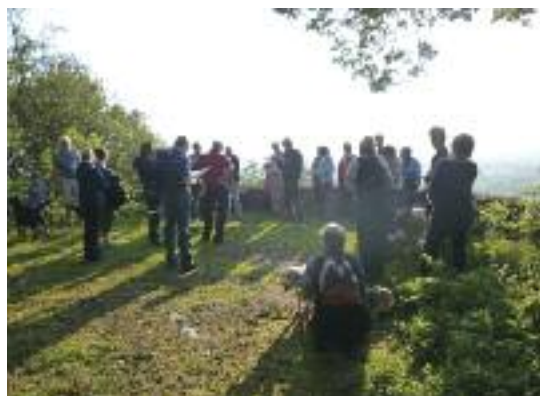
PAUSE FOR REFLECTION: Rick read a passage from the Bible en route to Stanner Nab