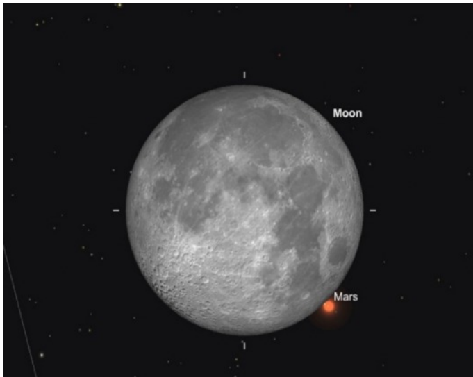
Mars disappears behind the Full Moon on December 8. It disappears at 4.55 (top) and reappears at 5.55am (bottom)